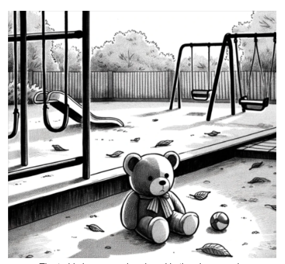
The teddy bear was abandoned in the playground.